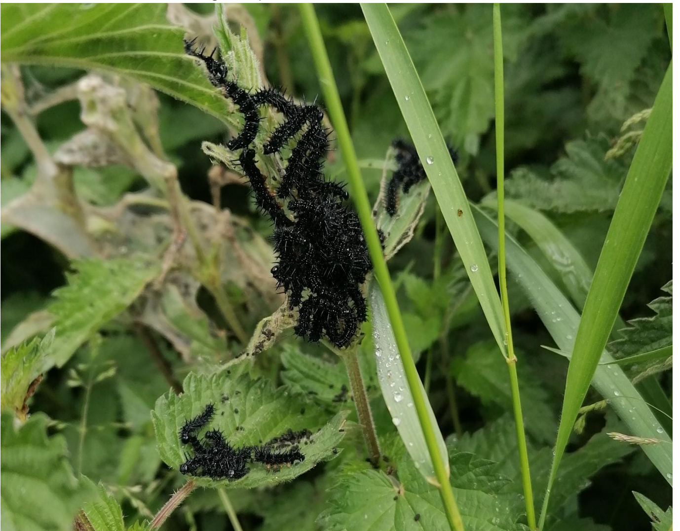
Peter Bird saw these Peacock Butterfly caterpillars on stinging nettles near Bluebank Lock.