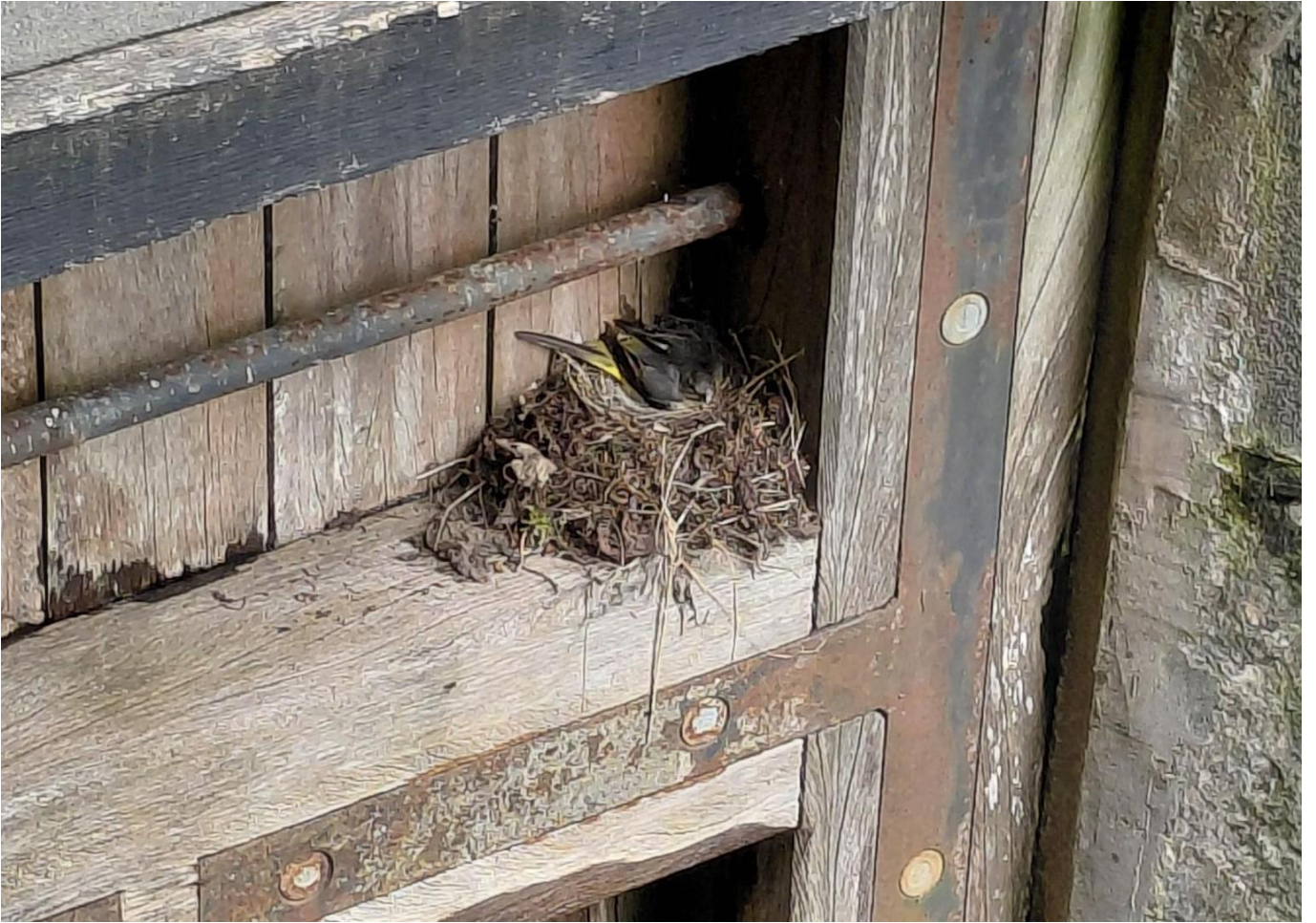
Andrew Palmer saw this Yellow Wagtail's nest on a lock gate on the Nottinghamshire section.