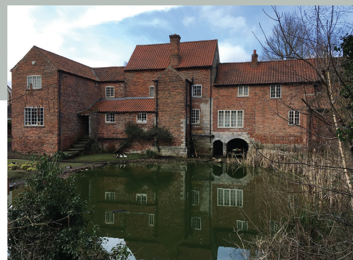
Monk's Mill, Scrooby

Poor William Butten , who some think came from Austerfield, although this is unproven, was called "a youth" by Gov. William Bradford in his passenger list of the Mayflower. He left as a servant with the family of Dr. Samuel Fuller . He was the only Mayflower passenger to die during the voyage itself, just three days before land was sighted.