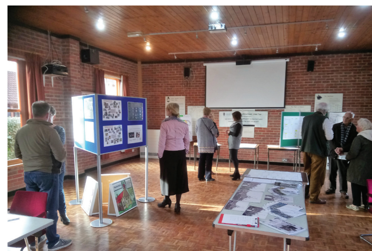
Consultation event at Scrooby

And we also asked if you liked the design examples that will be the 'brand' for our Pilgrim Roots activities. They received very positive comments from our consultees. We plan to repeat these events once we know we have succeeded with our application as we look forward to showing you how proposals have changed into very definite plans.