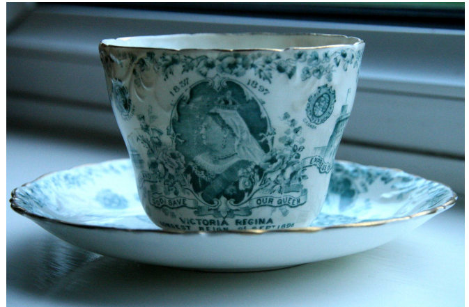
[Above] Queen Victoria Diamond Jubilee cup and saucer.

Plans are well under way for local celebrations during Jubilee weekend – see elsewhere in this issue – but it has been suggested that a lasting momento of the event, and of earlier jubilees, might be to produced a CD or DVD of images relating to not only the forthcoming jubilee, but also local celebrations from the past. Your editor has recently received a couple of examples of such materials as shown here with further images of the cup and saucer and views of contents of the Silver Jubilee programme are available via the Jubilee section of our community website. If other readers have memorabilia or photos relating to celebrations of past jubilees in our community and are willing to share them as part of such a community project, please get in touch with the editor. Full credit of sources will be incorporated in the final compilation, a copy of which would be offered to both Retford Library and Bassetlaw Museum.