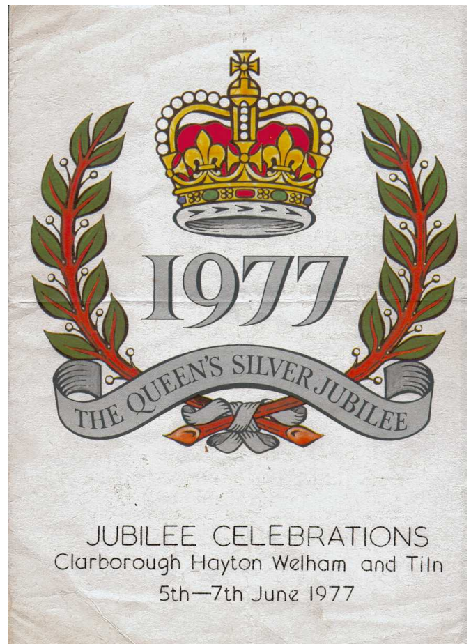
[Above] Programme frontpiece for the Queen's Silver Jubilee.