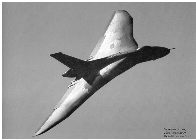
Shareham airshow, 22nd August 2009.

To those with long memories, Robin Hood is better known as RAF Finningley, Cold War V-bomber base and scene of memorable airshows where Vulcans thrilled (and deafened) crowds!